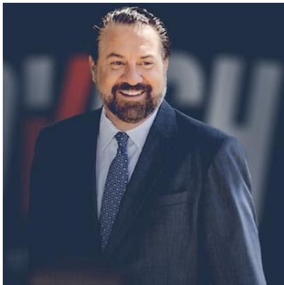
Mark Brnovich Website / BIO