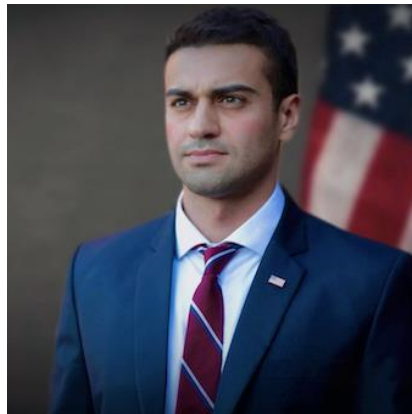
Abraham Hamadeh Website / BIO