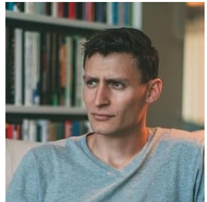
Blake Masters Website / BIO

Due to circumstances beyond their control, Mark Brnovich and Blake Masters will not be able to appear in person, but will be sending videos to be shown at our luncheon.