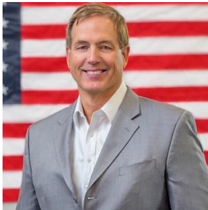
Jim Lamon Website / BIO