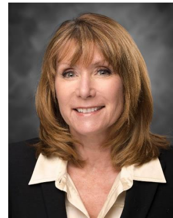
Bio and Position Description