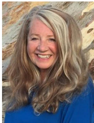
Bio and Position Description