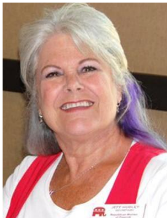
Bio and Position Description