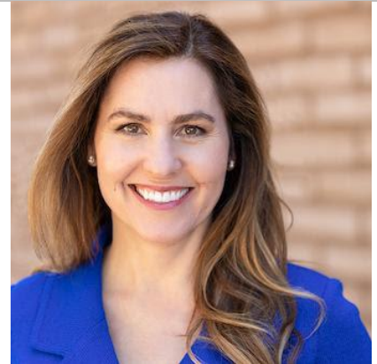
Dawn Grove Website / BIO