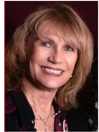
Bio and Position Description