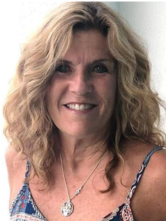
Bio and Position Description