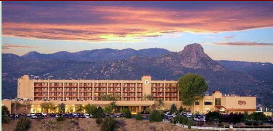
Prescott Resort & Conference Center 1500 E. Highway 69, Prescott, AZ