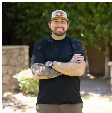
Eli Crane - U.S. Congress - Bio Website

REFER TO THE RWOP WEBSITE FOR A CANDIDATE or SPEAKER BIO