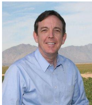
Ken Bennett - Arizona State Senate - Bio