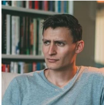
Blake Masters U.S. Senate Bio Website