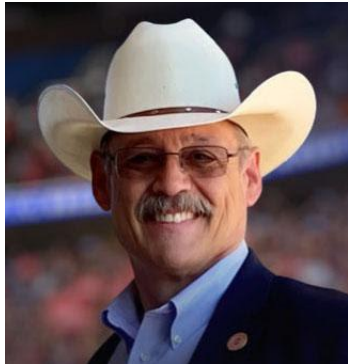
Mark Finchem Arizona Secretary of State Bio Website