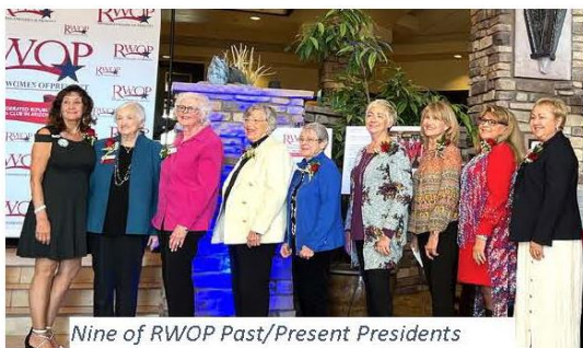
Nine of RWOP Past/Present Presidents

with each receiving a beautiful corsage made up of a Red Rose, White Baby's Breath and luscious greenery...so pretty and deserving to see them adorned with their corsages as they worked hard to make the club what it is today!