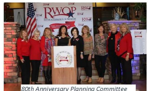
80th Anniversary Planning Committee