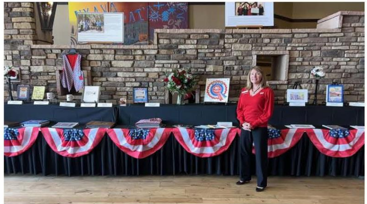
Historian Table of RWOP Memorabilia

A very interesting exhibit was presented with an extensive and beautifully displayed table of scrapbooks, awards, pictures, etc. which created a fun walk down memory lane.