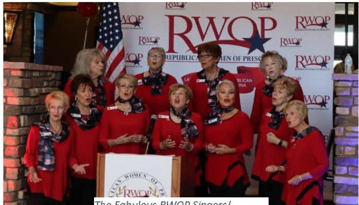
The Fabulous RWOP Singers!

Nine of RWOP's Past (and one present) Presidents were honored on the stage