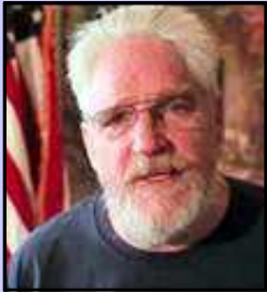
Yavapai College's Professor of Freedom